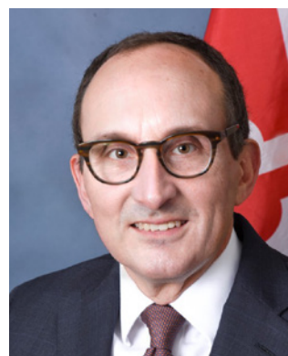
MONTE TARBOX JULY 1, 2018 - JUNE 30, 2024