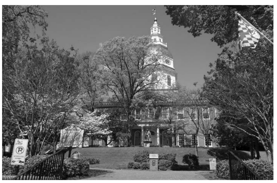
The Maryland State House is the oldest state capitol in continuous legislative use and is the only state house ever to have served as the United States capitol.

Synopsis: This bill applies to members of the Correctional Officers' Retirement System who, as a result of legislation introduced during the 2016, 2017 and 2018 legislative sessions, were required to transfer from either the Employees' Retirement or Pension Systems due to a change in membership status but who did not transfer prior service credit from the Employees' Systems to CORS. House Bill 861 provides that when these members retire and earn a vested benefit from the Employees' or Correctional Systems, the members are entitled to receive, subject to current